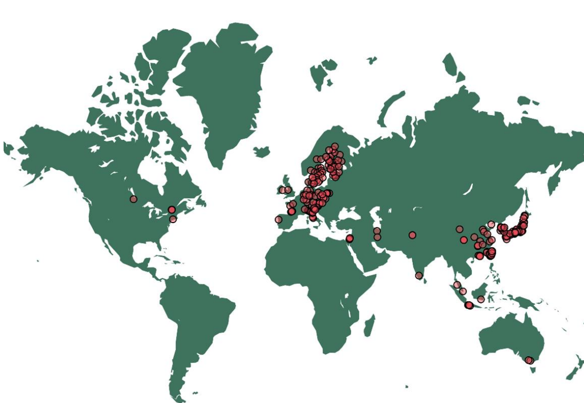
Figure 1: Location of HPH members

The International Network of Health Promoting Hospitals and Health Services (HPH) was founded on the settings approach to health promotion as a response to the WHO Ottawa Charter for Health Promotion action area, ‘reorienting health services’ (5). WHO inspired a movement by initiating an international network of national and sub-national networks that supported the implementation of this concept (6). The whole-of-system approach of HPH produced action that brought several health reform movements together: patients’ or consumer rights, primary health care, quality improvement, environmentally sustainable (“green”) health care and health-literate organizations. The organizational development strategy of HPH involved reorienting governance, policy, workforce capability, structures, culture, and relationships towards health gain of patients, staff, and population groups in communities and other settings. As of 2020, the HPH network consists of more than 600 hospitals and health service institutions from 33 countries.